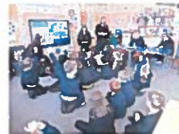
S3 pupils visit to Rothes Primary