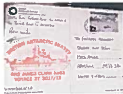
Postcard from Rothera Research Base